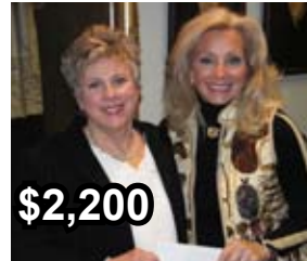
Chaminade Mother's Club Luncheon