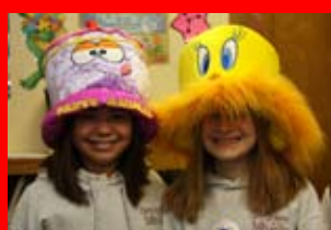
Hats On Day '09 p. 4