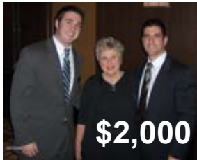
A.R.M. Flame Awards