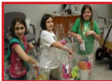
Girl Scout Troop 1186 Buckets of Love