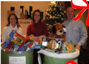
The Koman Group

Toy drives are a sign of the season around Friends, and this year was no different. Generous groups and individuals donated new toys to help make a child's Holiday special for a struggling family. Toys have propelled this organization from the beginning, with the Toy Closets at each treatment center as our inaugural program. Thank you to everyone who donated a toy to keep this long-standing tradition going.