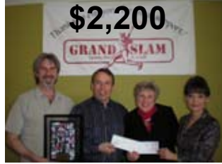
Grand Slam's 1st Anniversary Party