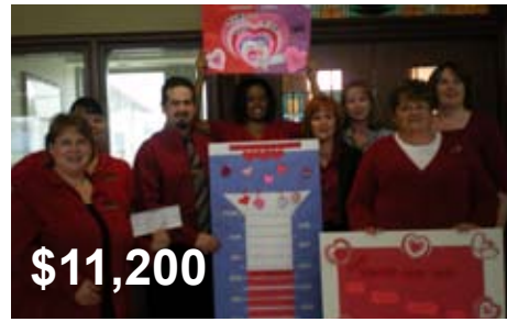
Southwest Bank's "Touch the Heart of a Child"