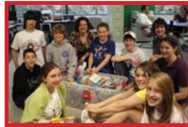
B'nai Amoona 7th and 8th grade volunteers