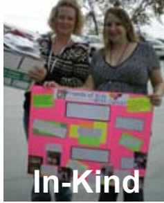
Healthlink's Hat Collection