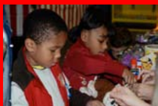
Winter Wonderland p. 3