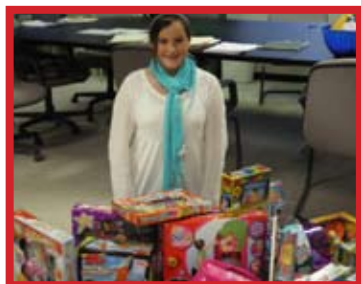
Lily Briscoe's Skating Birthday Party