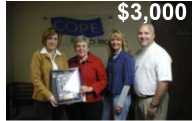
Cope Plastics Golf Tournament