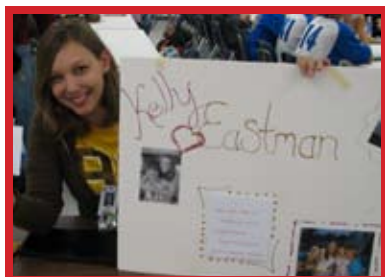
Kelly Eastman T-Shirt Sale