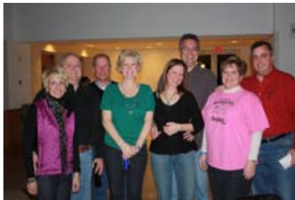
The Kings and Queens of music trivia, our winners!