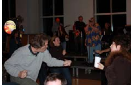
Trivia Buffs letting loose to the sounds of the Max Cherry Band.