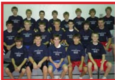
Chaminade Soccer Shootout