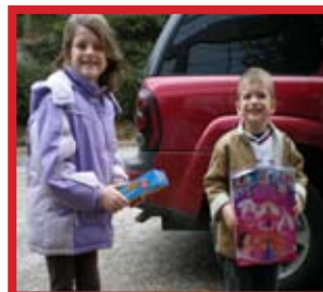
Birthday Toy Donation