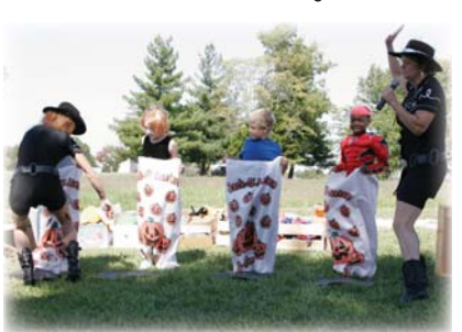
1999 Halloween Party