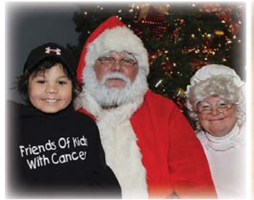
1997 Winter Wonderland